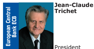
Jean-Claude Trichet President