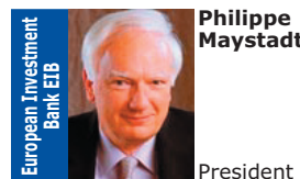
Philippe Maystadt President