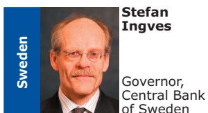
Stefan Ingves Governor, Central Bank of Sweden