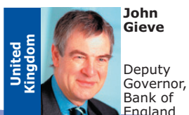
John Gieve Deputy Governor, Bank of England