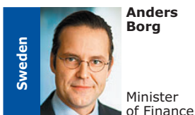
Anders Borg Minister of Finance