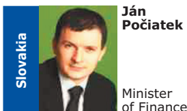
Ján Počiatek Minister of Finance