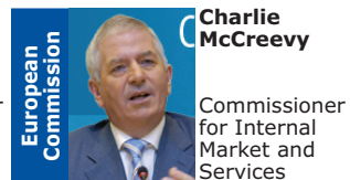
Charlie McCreevy Commissioner for Internal Market and Services