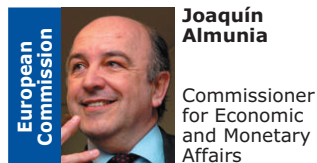
Joaquín Almunia Commissioner for Economic and Monetary Affairs