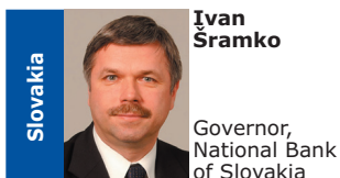
Ivan Sramko Governor, National Bank of Slovakia