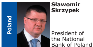
Sławomir Skrzypek President of the National Bank of Poland