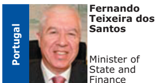
Fernando Teixeira dos Santos Minister of State and Finance