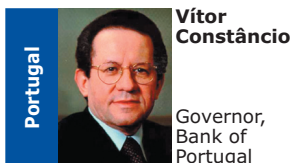
Vítor Constâncio Governor, Bank of Portugal