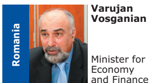
Varujan Vosganian Minister for Economy and Finance