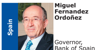
Miguel Fernandez Ordoñez Governor, Bank of Spain