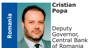
Cristian Popa Deputy Governor, Central Bank of Romania