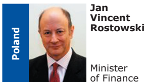
Jan Vincent Rostowski Minister of Finance