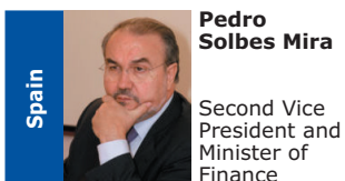
Pedro Solbes Mira Second Vice President and Minister of Finance