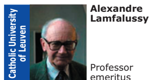
Alexandre Lamfalussy Professor emeritus