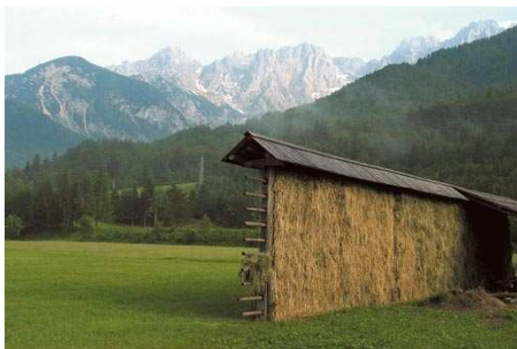
Author: D. Mladenovič, Source: STB