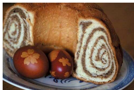
Author: Bobo, Source: STB

On account of the aforementioned challenges, food safety is becoming an increasingly topical issue. If we wish to solve the problem of a food supply sufficient for a growing world population, agricultural production will have to increase. Specific actions are needed in order to enable an immediate response to the increased demand for food.